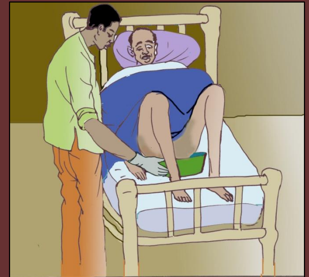
6. Use a bedpan – male.