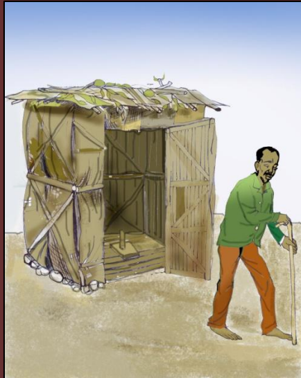
2. Use a cane to go to the latrine.