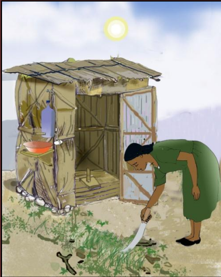
1. Clear the path to the latrine.