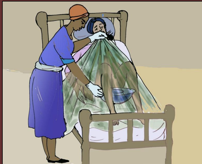
5. Use a bedpan – female.