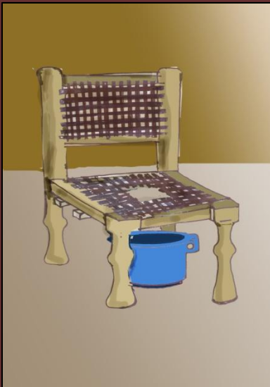
4. Use a Potty Chair.